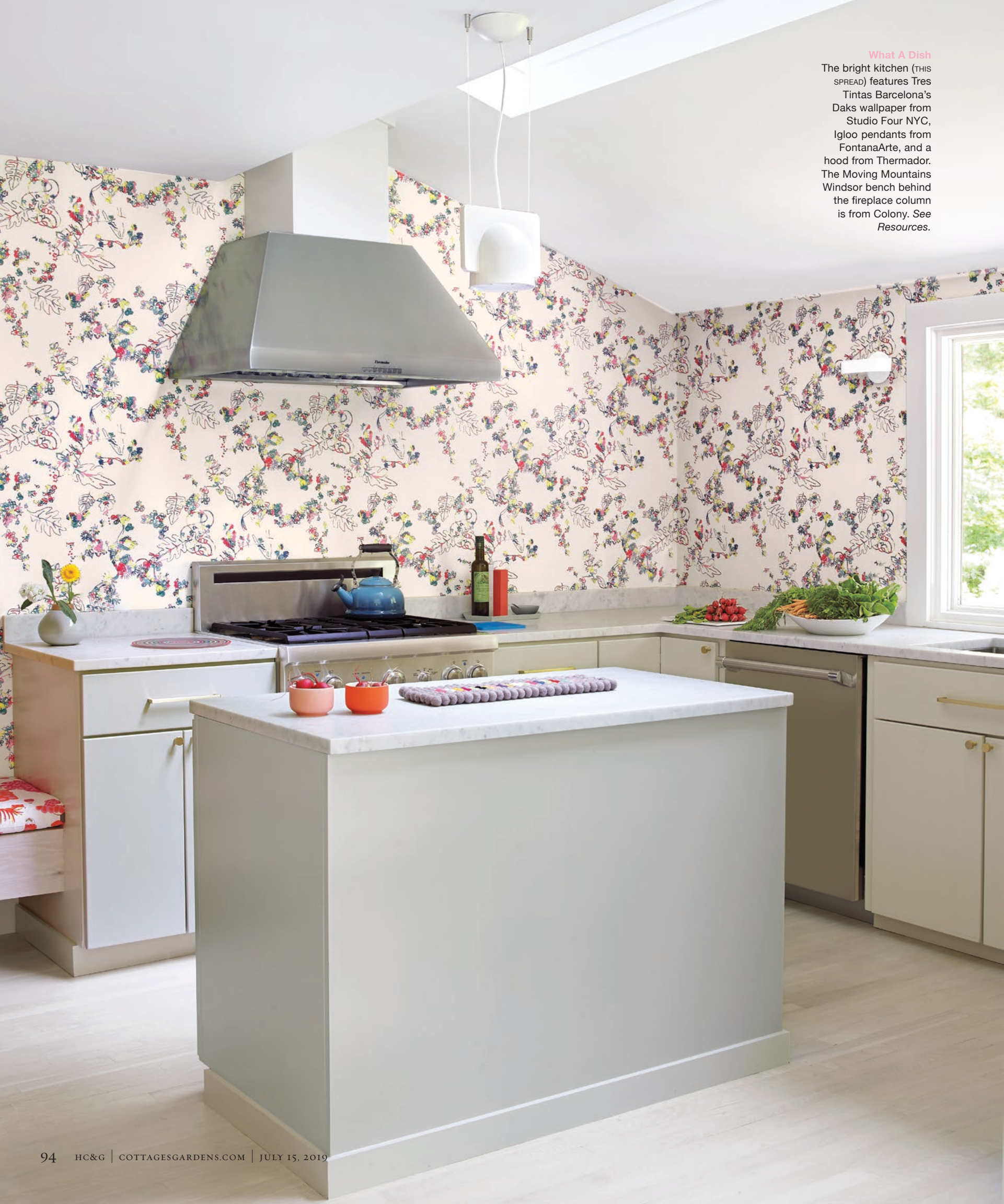
What A Dish The bright kitchen (THIS SPREAD) features Tres Tintas Barcelona's Daks wallpaper from Studio Four NYC, Igloo pendants from FontanaArte, and a hood from Thermador. The Moving Mountains Windsor bench behind the fireplace column is from Colony. See Resources.

“As you approach the house from the long gravel driveway, it reveals itself in a wonderfully welcoming way”