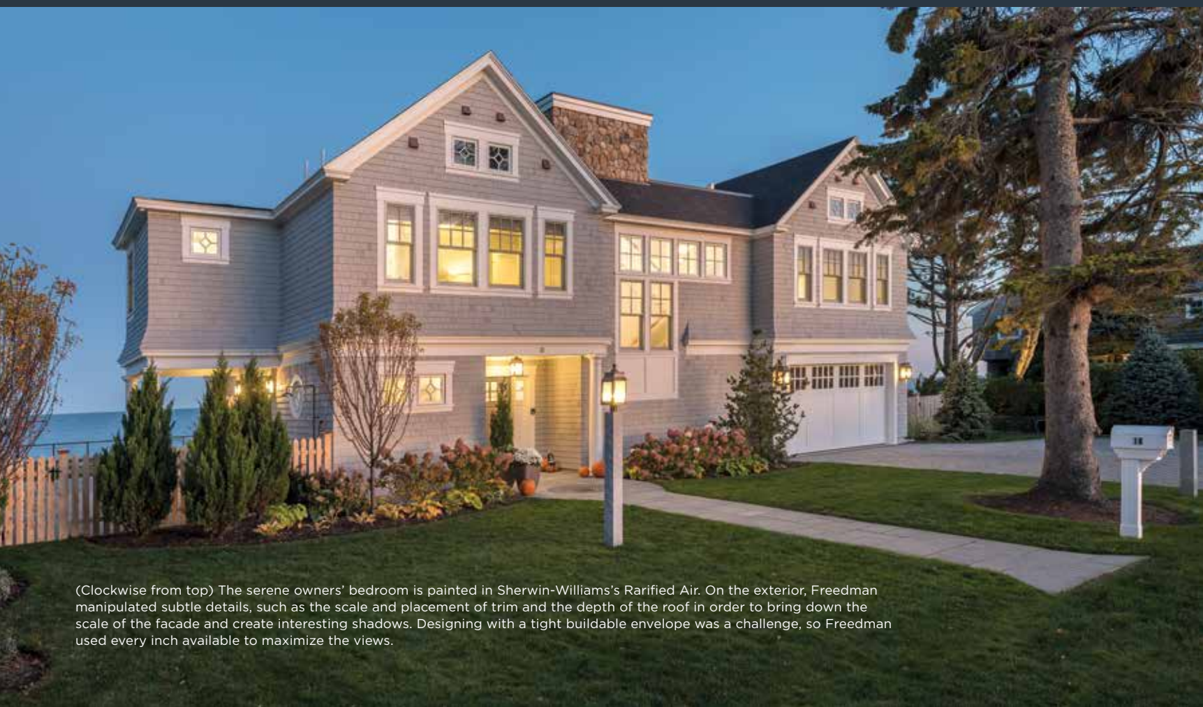
(Clockwise from top) The serene owners' bedroom is painted in Sherwin-Williams's Rarified Air. On the exterior, Freedman manipulated subtle details, such as the scale and placement of trim and the depth of the roof in order to bring down the scale of the facade and create interesting shadows. Designing with a tight buildable envelope was a challenge, so Freedman used every inch available to maximize the views.