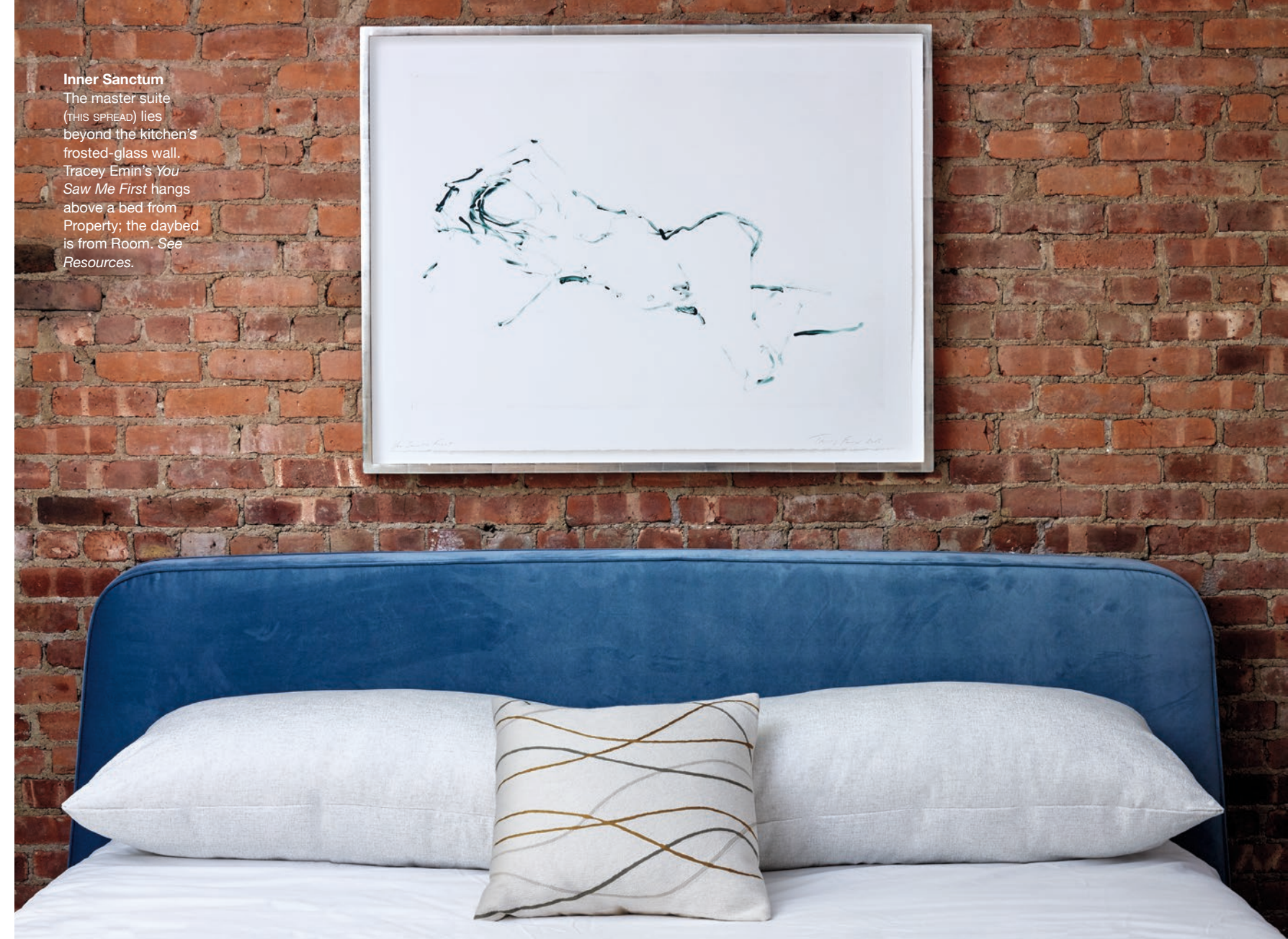
Inner Sanctum The master suite (THIS SPREAD) lies beyond the kitchen's frosted-glass wall. Tracey Emin's You Saw Me First hangs above a bed from Property; the daybed is from Room. See Resources.

environment that would allow it to shine. The decorator opted for a mostly neutral palette with touches of blue and a scrupulously curated array of striking minimalist furnishings. "Blue pops against the white floors and brings out the orange in the original brick wall," explains Cherny, who worked closely with Parness to establish continuity in both the public areas and private spaces, which are separated by a simple frosted-glass partition wall—not unlike circa-1970s artist's lofts in formerly boho SoHo. But times have changed. "I did host a salon-style art show in the apartment one night," Parness says, "although I don't normally entertain. This space is really just for me." ✨