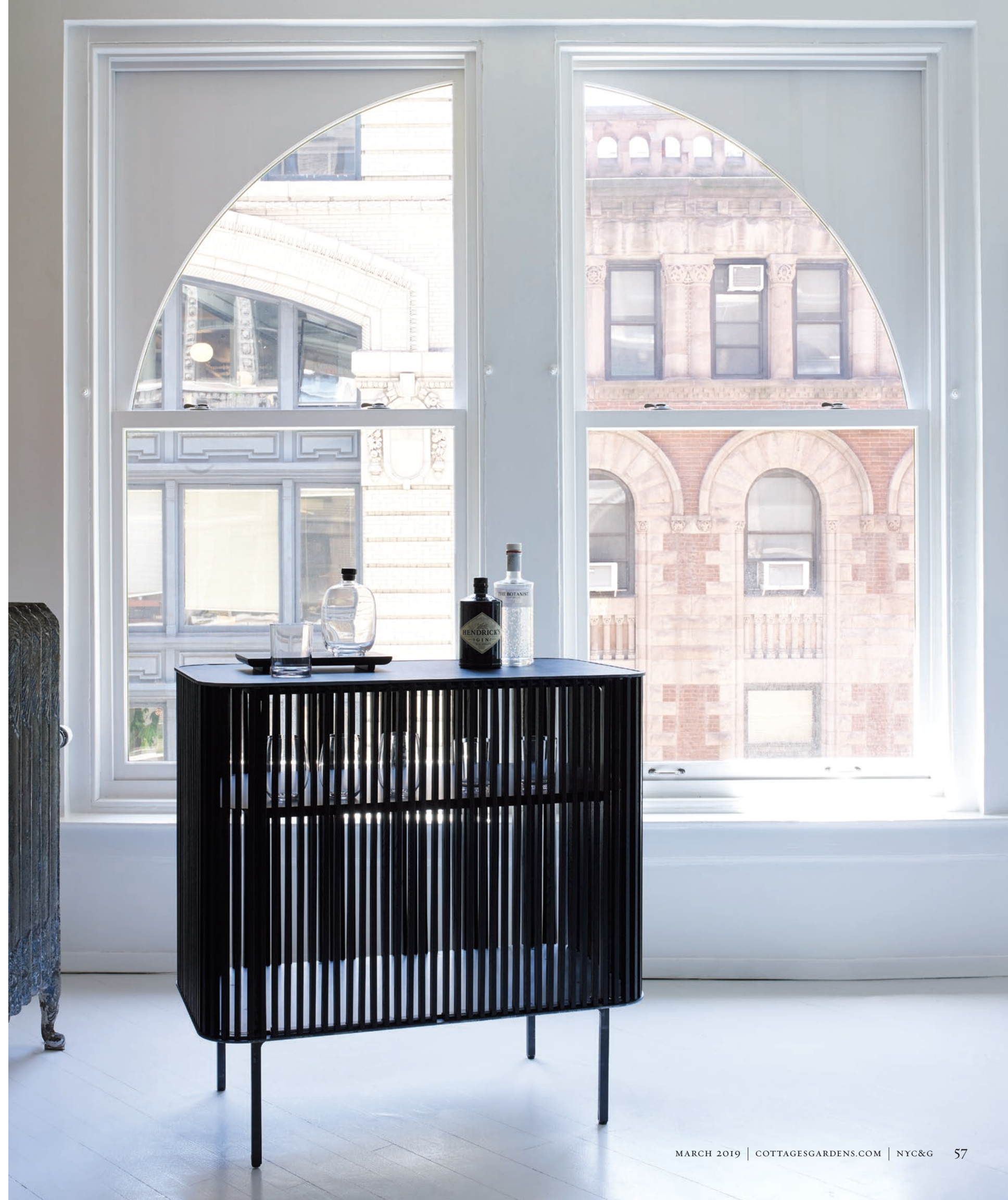
SPREAD), where a photograph by Cindy Sherman hangs above a Gallotti & Radice desk. The bar cart is by Klein Agency. See Resources.