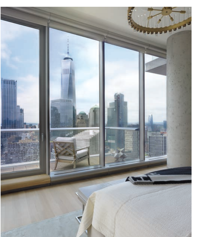
The master suite (THIS SPREAD) is furnished with a Mitchell Gold + Bob Williams bed, a light fixture from Arteriors, and a Williams Sonoma Home bench. The tub and double sink in the marble-tiled bath are custom designs by Herzog & de Meuron. See Resources.