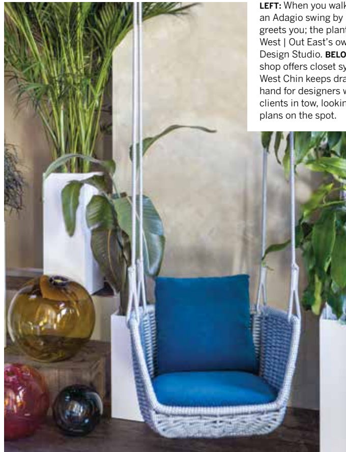
LEFT: When you walk into the space, an Adagio swing by Paola Lenti greets you; the planters are from West | Out East’s own line, FTF Design Studio. BELOW: Because the shop offers closet systems, owner West Chin keeps drafting supplies on hand for designers who arrive with clients in tow, looking to draw up plans on the spot.

While the new 1,200-square-foot showroom, which opened last September on Riverside Avenue, carries the cool, minimalist furnishings